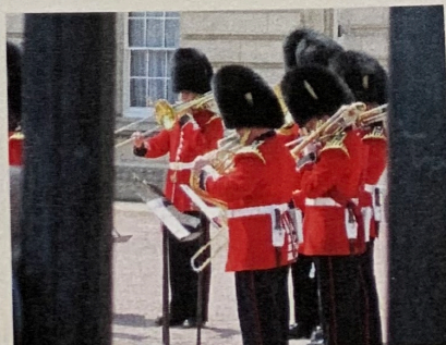
Changing of the Guard