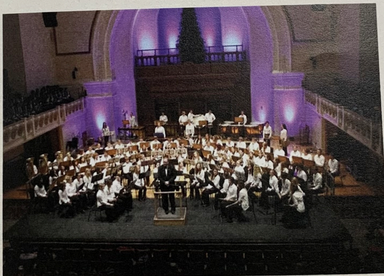
Cadogan Hall Concert