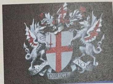
City of London Crest